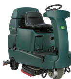
Nobles® Speed Scrub™ Micro-Rider Scrubbers

Easy to learn, one button controls decrease the time spent training, and shifts it to more time spent cleaning. Choose either disk for smooth floors with out debris or cylindrical scrub heads for capturing light debris. Just scrubbed floors are immediately dry and safe for traffic and detergent is automatically mixed and measured precisely with optional FaST®. Also available with ec-H2O™. With ec-H2O™ option, you'll use 70% less water than conventional scrubbing methods. Detergent clean. Water safe. ec-H2O technology converts water into a powerful cleaning solution. 29 gallon solution and recovery tanks.