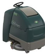
Nobles® Speed Scrub® 350 Stand-On Floor Scrubbers

Maximize machine usage with up to 94 minutes between dumps and fill cycles and up to 4 hours of battery run time. Reduce the risk of slip-and-fall accidents with advanced squeegee design. Incorporate daytime cleaning with Quiet-Mode™ that reduces machine noise levels to as low as 59.7 dBA. Ensure operator comfort and control with ergonomics and easy-to-use steering and controls. Smart-Fill™ automatic battery watering system makes battery maintenance safer by removing the task of checking, opening and filling flooded batteries. Clean over 30,000 square feet per hour without sacrificing performance. Drive motor: 24 VDC, 0.64 HP; Vac motor: 24 VDC, 0.62 HP.