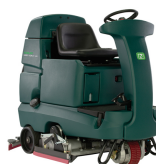
Nobles® Speed Scrub™ Micro-Rider Scrubbers

Easy to learn, one button controls decrease the time spent training, and shifts it to more time spent cleaning. Choose either disk for smooth floors with out debris or cylindrical scrub heads for capturing light debris. Just scrubbed floors are immediately dry and safe for traffic and detergent is automatically mixed and measured precisely with optional FaST®. Also available with ec-H2O™. With ec-H2O™ option, you'll use 70% less water than conventional scrubbing methods. Detergent clean. Water safe. ec-H2O technology converts water into a powerful cleaning solution. 29 gallon solution and recovery tanks.